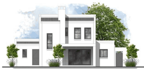
BACK ELEVATION (ILLUSTRATING BUILT OUT OPTION)