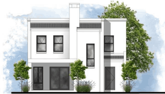
BACK ELEVATION (ILLUSTRATING BUILT OUT OPTION)