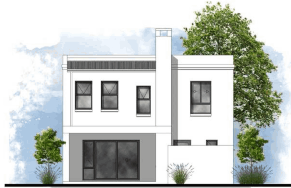
BACK ELEVATION (ILLUSTRATING BUILT OUT OPTION)